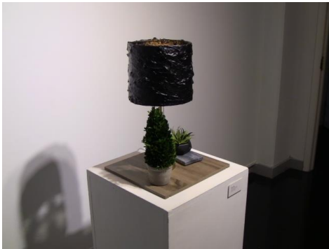
Artificial Sunlight , Lamp, Fake Plants, Consumer Objects and Roofing Tar, 2017