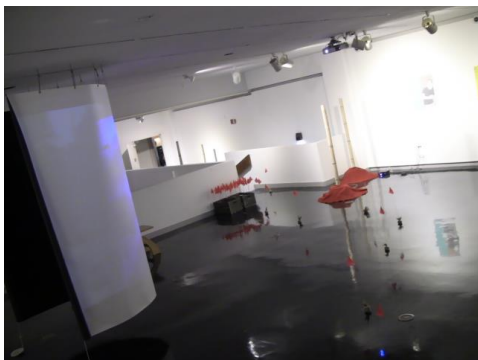
Johnny Appleseed , Installation/Performance, Flags, Plaster, Coffee, Burlap, 2017 Changes daily