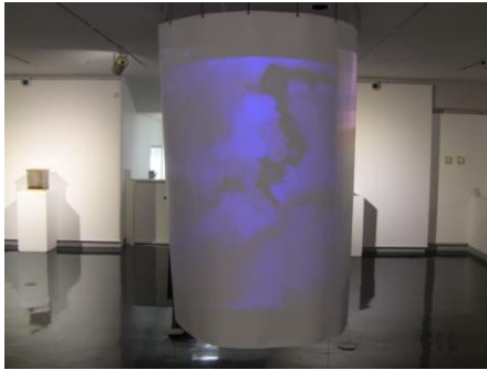
Triptych , Video Installation, 2017 7'x11'x7'