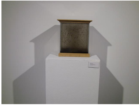
Conquest of Bread , Glass, wood, bread, and time, 2017 13"x12"x13"