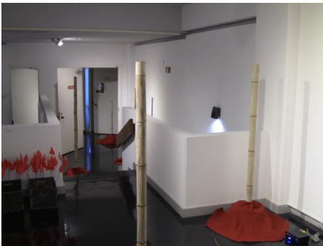
Commune , ad hoc speakers made from bamboo, 2017 Dimensions vary