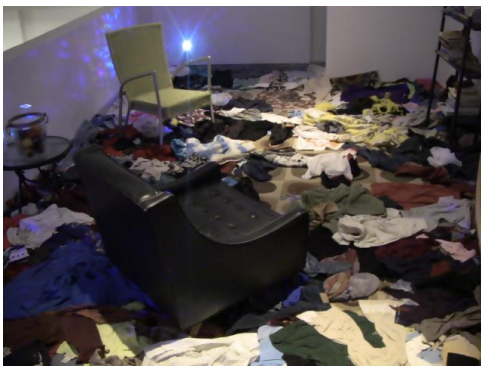
Lounge , installation featuring discarded clothing and found object, 2017 Fit to volume of installation space