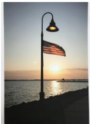
“Old Glory” Photo 15x11