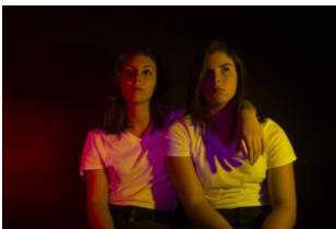
“Sister's” Version 5 Photo 11x14