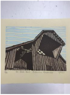
“The Stock Barn” Relief Color Print 5x7