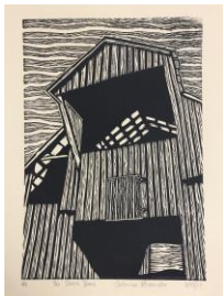
“The Stock Barn”