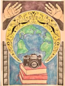
“Self Portrait” Drawing & Watercolor 18x24