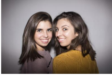
“Sister’s” Version 12