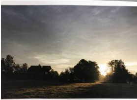
“Golden Hour on the Farm” Photo 11x15