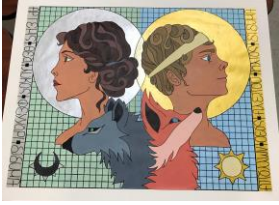
“Artemis and Apollo” Painting 24x18