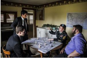
“The Four Horseman” Photo 8x10