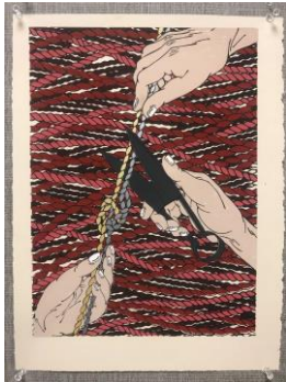
“Cutting of the God’s and Goddess’s Fate”