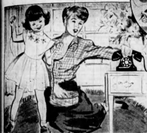
Extension telephones in easy- to-go places save time and steps, afford privacy on the telephone, protection in an emergency.