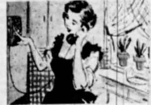
CONVENIENCE IN THE KITCHEN An extension telephone in the kitchen makes your household run more smoothly.

An extension telephone is "Mother's Helper" and a friend of all the family. It keeps you from missing important calls—makes your telephone more valuable by increasing its usefulness. One or more extension telephones can now be installed in your home at surprisingly low cost. You don't need to write us or come to the office. Just call the Business Office today.