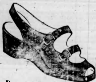
D. 2 strap, in Town brown, Kelly green, or blue leather.