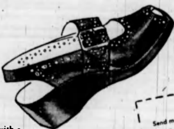
F. Sandra Sabot, with a buckle... red, black or brown leather