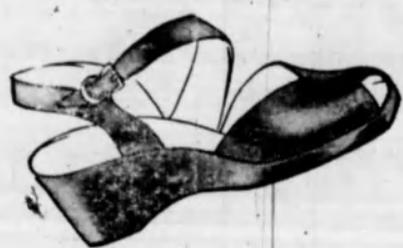
E. Sweep-to, the side strap in red, green or black leather.