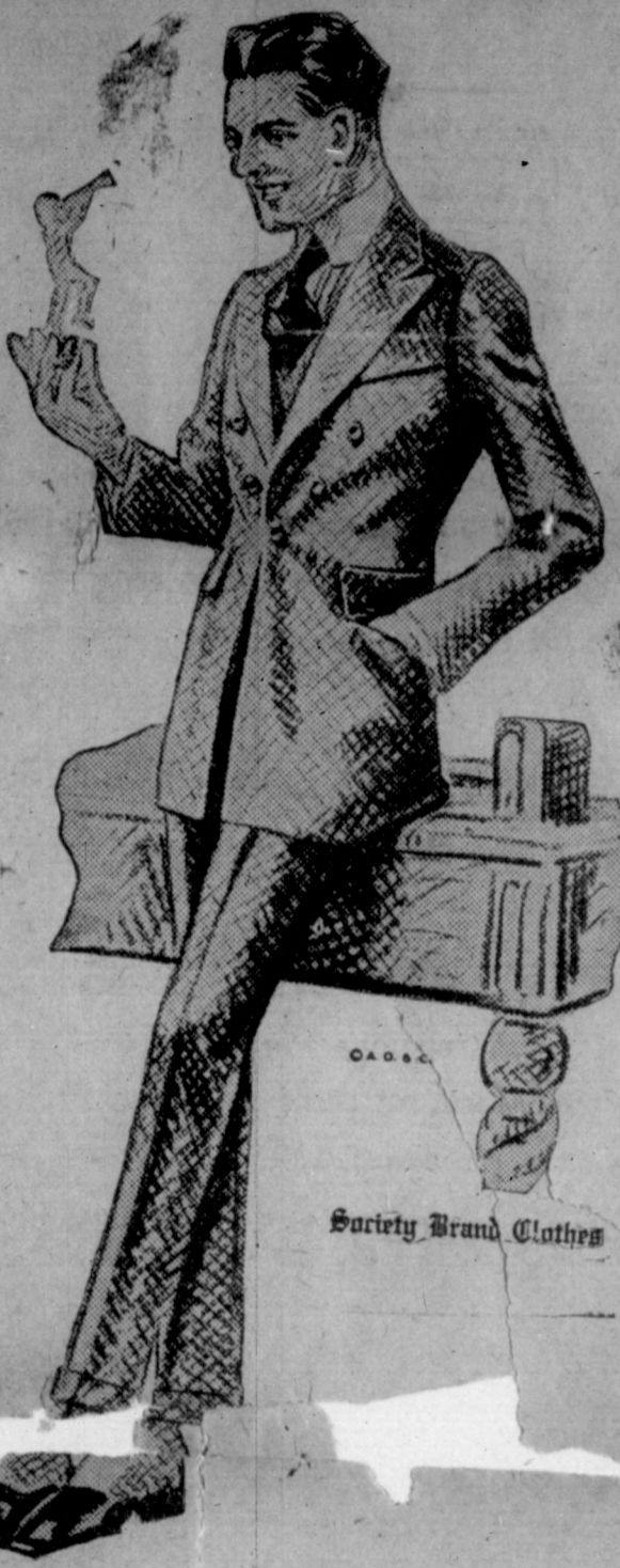
Society Brand Clothes

yourself a... rule and bother of "baking day." Cakes, cookies and all kinds of delicious pastry freshly made every day. LET US BE YOUR COOK. HORNBEAK BROS. Lake Street Fulton, Ky.