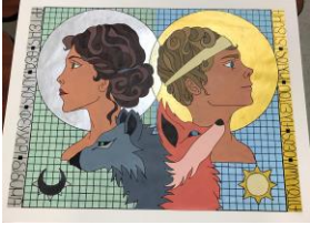
“Artemis and Apollo” Painting 24x18