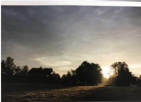
“Golden Hour on the Farm” Photo 11x15