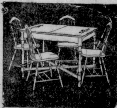
The Sellers Extension Dinette is ideal for easy dining rooms. Graceful chairs are usually sturdy. Available in many fascinating colors, 5 pieces.

Hot weather makes cooking a burden unless you have a Modern Kitchen Cabinet