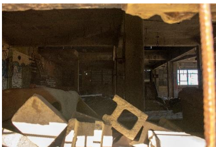
Untitled no.4 from documentary series, photography, 2018,