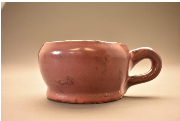
Red Mug, ceramics, 2019, 2" x 4"