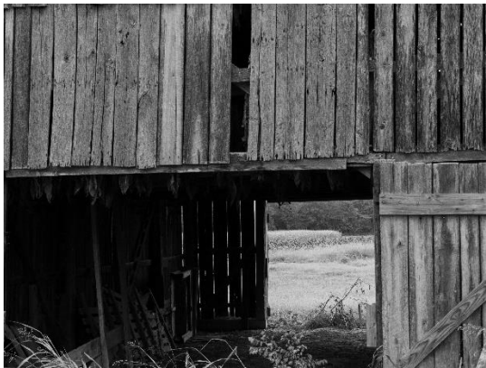
Barn , photography, 2018, 8" x 10"