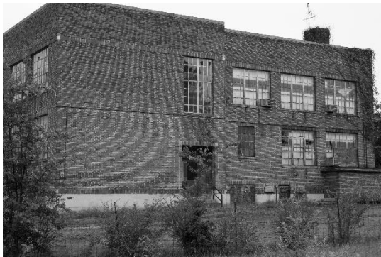
Old Sinking fork , photography, 2018, 8" x 10"