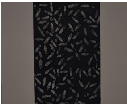
Dependency , etching print, 2019, 15" x 11"