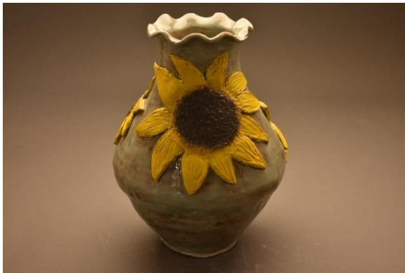
Sunflower vessel, ceramics, 2019, 13" H