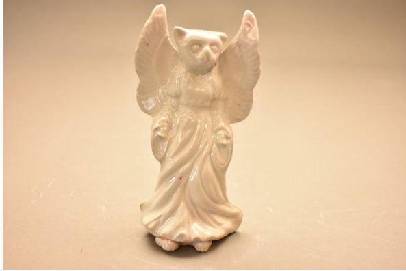
Untitled , ceramics casting, 2019, 9" H