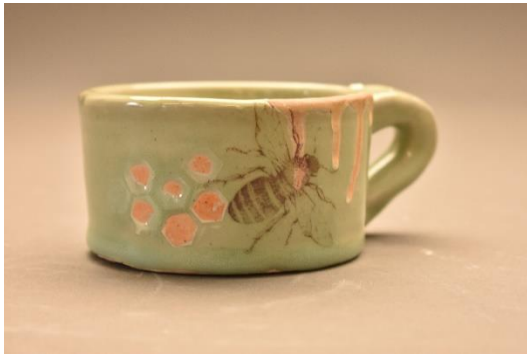
Bee Mug no.1, ceramics, 2019 2" x 4"