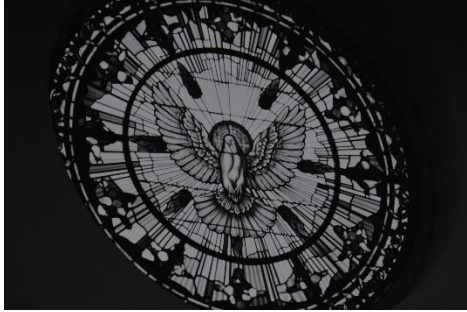
Holy Spirit window , photography, 2018, 8" x 10"