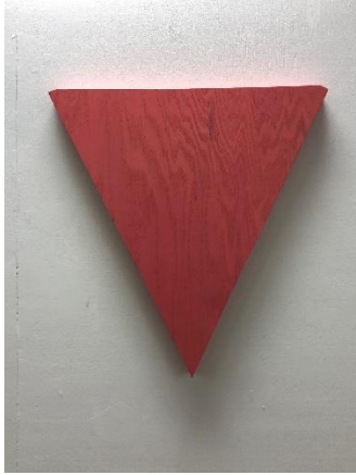
From horror to pride , wood sculpture, 2019, 24" X 24"