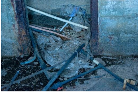
Untitled no.3, from documentary series, photography, 2018,