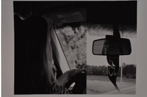
Portrait of a handicapped driver , photography, 2018,