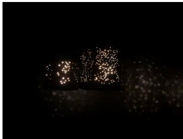
Constellation box , wood sculpture,