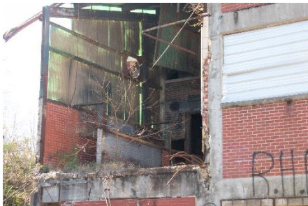
Untitled no.2 from documentary series, photography, 2018,