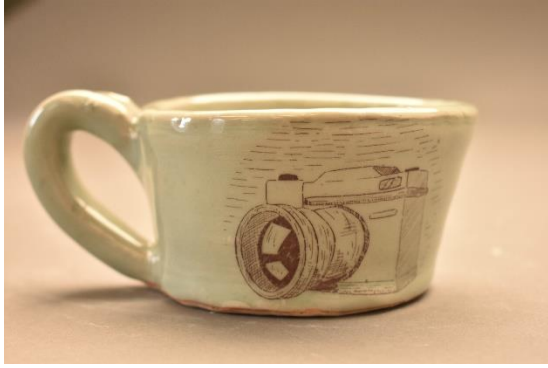
Camera Mug no.1, ceramics, 2019, 2" x 3"