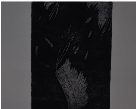
The Fallen , etching print, 2019, 15" x 11"