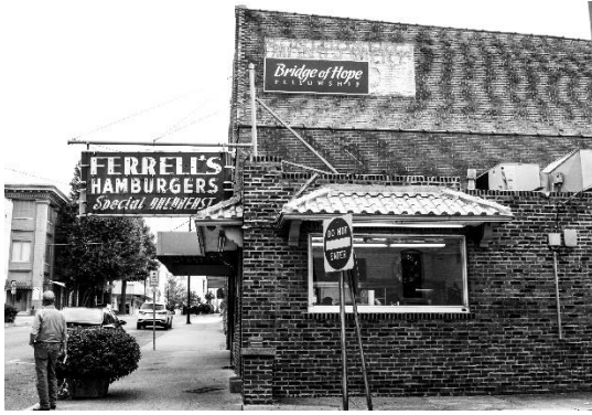
Farrell's Hamburger , photography, 2018, 8" x 10"