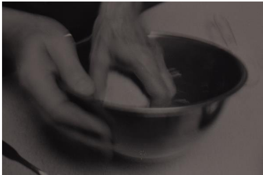
Untitled no.2 from A Motherly Father series ,