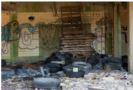
Untitled no.1 from documentary series, photography, 2018,