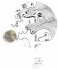
the Water's full 2020 book page 6 x 6 in.