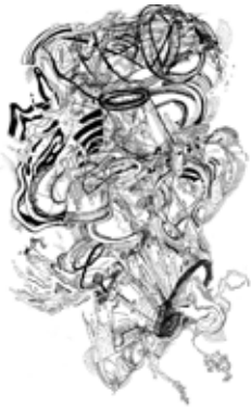
The blue of distance 2020 ink on french paper