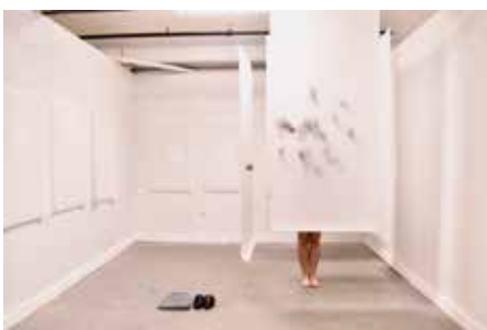
No one dared Disturb the Silence 2020 screen print on mylar, paper 36 sq ft.