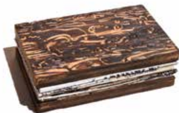
Language of the Trees II 2020 Perfect binding, newspaper, BFK, relief