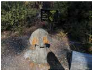
You can go your own way 2020 signage, photography