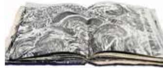
Be careful which way you Lean, detail 2020 Relief, canvas, mulberry