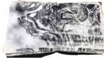
Be careful which way you Lean 2020 Relief, canvas, mulberry