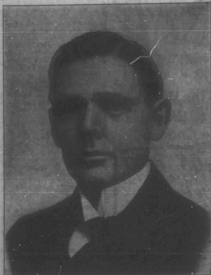
Composed of Ballard Cabale, Fulton, Graves and Hickman Counties

Announces for Circuit Judge in First Judicial District