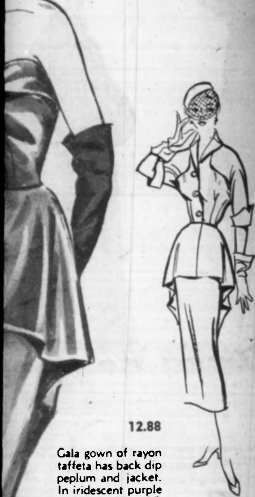
12.88 Gala gown of rayon taffeta has back dip peplum and jacket. In iridescent purple and black. 10 to 16.