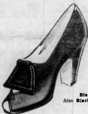
Black Calf Also Black Suede 17.95