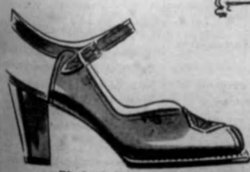
Black Calf 17.95

Fall favorites that are shining examples of the skill and dexterity that make Florsheims the most walked about shoes in America.