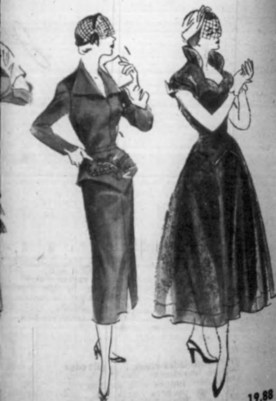
10.88 Two piece wool crepe with bugle beads, in navy, red, green. Sizes 10-16. 13.08 Rayon lace with taffeta slip in toast, peacock, blue or mauve. Sizes 10-16. 19.88