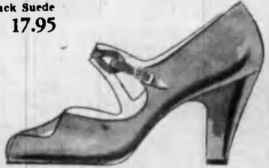
Black or Brown Calf also Black, Brown or Green Suede 17.95