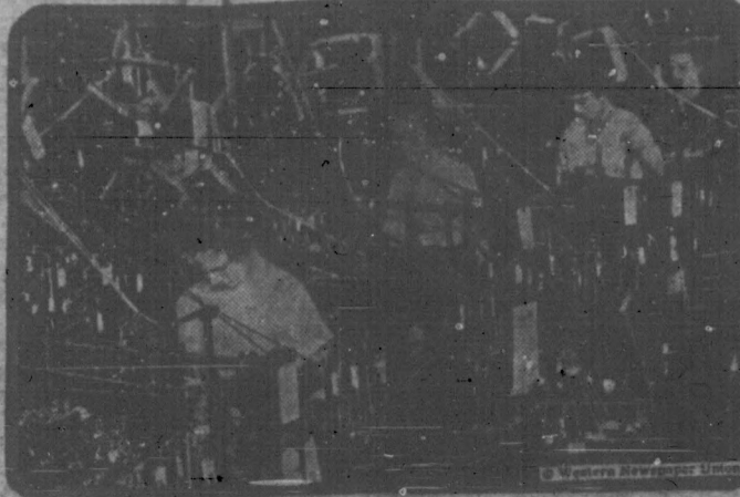
The manufacture of hat cords for the various branches of the United States army is in a large part carried on by women in factories in this country. This picture shows the machine wrapping twisted threads for hat cords.