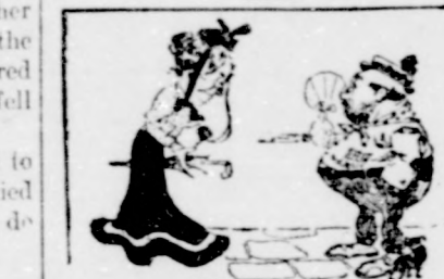
Kind Old Lady—Have you ever made an effort to get work?

Beggar—Yes, ma'am. Last month I got work for two members of my family, but neither of them would take it.