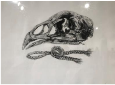
The Two Words the Two Birds Never Said I, 2021, Lithography, 15"x20"