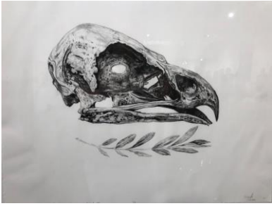
The Two Words the Two Birds Never Said II, 2021, Lithography, 15"x20"