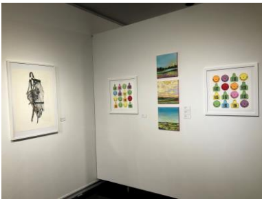
View of BFA Show 4