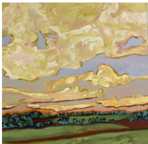
Rolling Clouds, 2021, Oil Paint, 12"x12"