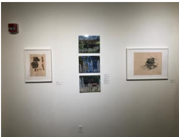
View of BFA Show 3