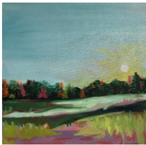
Glowing Pines, 2021, Oil Paint, 12"x12"