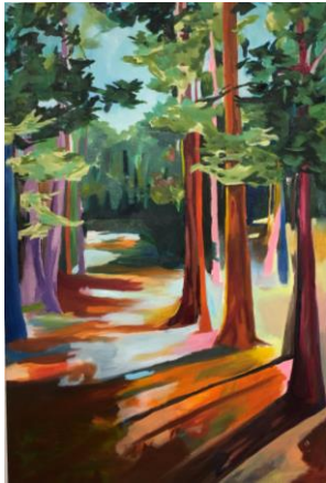
Light My Way, 2021, Oil Paint, 36"x24"