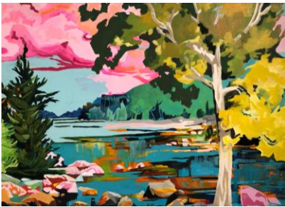
Happy Camper, 2022, Oil Paint, 3'x5'