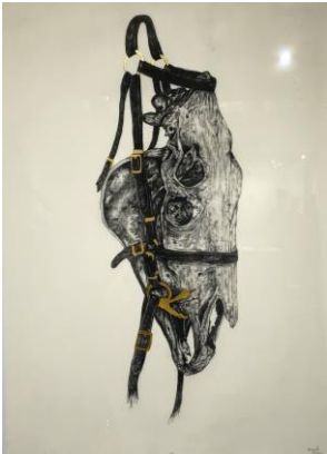
Reflections of a Champion, 2021, Lithography, 30"x22"