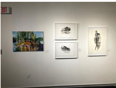
View of BFA Show 5