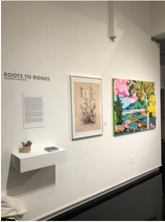
View of BFA Show 1