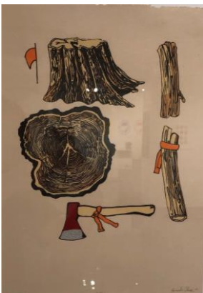
Woodlot, 2022, Screen Printing, 14"x10"