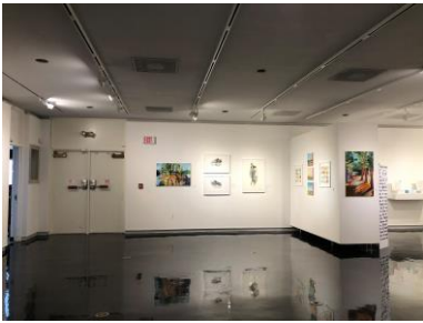
View of BFA Show 2