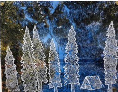
The Land Between II, 2022, Mixed Media (photography, screen print, acrylic paint), 11"x14"