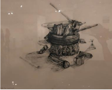
Behind the Woodshed, 2022, Lithography, 12"x16"