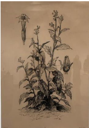
Burley, 2021, Lithography, 30"x22"