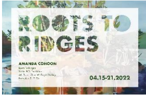
BFA Postcard, 2022