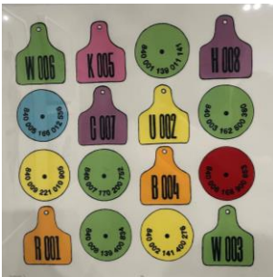
Tagged I, 2022, Screen Printing, 17"x17"