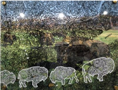
The Land Between I, 2022, Mixed Media (photography, screen print, acrylic paint), 11"x14"