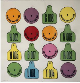
Tagged II, 2022, Screen Printing, 17"x17"