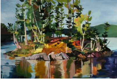
The Cool of the Morning, 2021, Oil Paint, 24"x36"