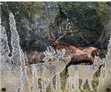
The Land Between III, 2022, Mixed Media (photography, screen print, acrylic paint), 11"x14"