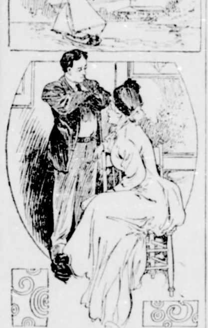
"The Ideal Way to Reform a Sinner is to Be as Good as You Can to Him."