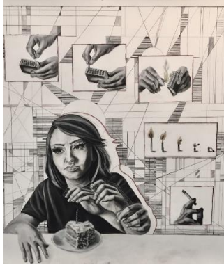
Birthright , charcoal, graphite, pastel, conte, sewn string, 3' X 3', 2020, Pullen_Kerrie_Birthright