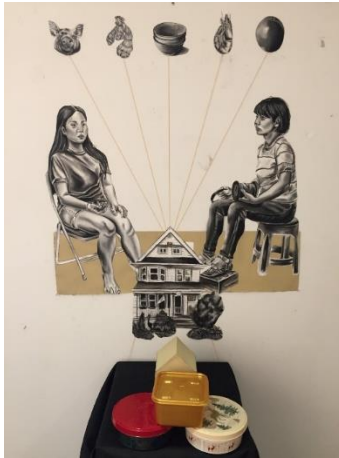
Eat With Me , charcoal and conte, string, found objects, food, 5 ½' X 2' X 2', 2021, Pullen_Kerrie_EatWithMe