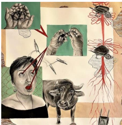
Tonsure , charcoal, conte, gouache, pastel, sewn patterns, arranged drawings, 3' X 2 ½', 2021, Pullen_Kerrie_Tonsure