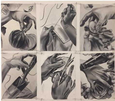
Hands that Make Us , charcoal and conte on paper, 2' X 2', 2021, Pullen_Kerrie_HandsThatMakeUs