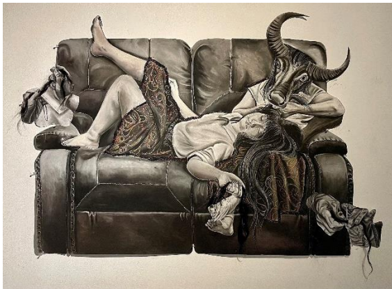
Carabao Care , charcoal, conte, pastel, layered drawings and hair, 2' X 4', 2021, Pullen_Kerrie_CarabaoCare