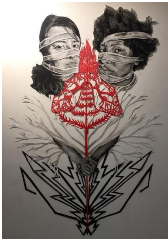
Connected , charcoal, conte, cut and arranged paper, 5' X 3', 2020, Pullen_Kerrie_Connected