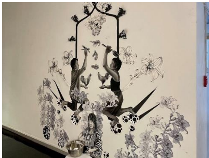
Detail image of Take up the Brown