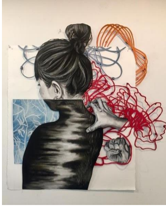
Mother , 2020, charcoal, conte, arranged paper cut outs, 2' X 1 ½', Pullen_Kerrie_Mother