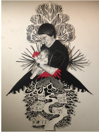
Father , charcoal, conte, arranged paper and drawings, 4' X 2 ½'. 2020, Pullen_Kerrie_Father