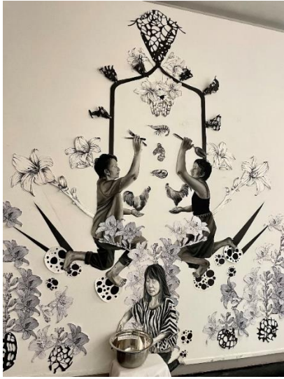
Take up the Brown , charcoal, conte, pen, drawn pieces cut out and arranged, found object, food, 6 ½' X 8', 2021, Pullen_Kerrie_TakeUpTheBrown