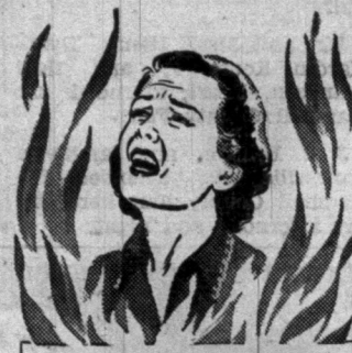
How Lydia Pinkham's works it acts through a woman's sympathetic nervous system to give relief from the "hot flashes" and other functionally-caused distresses of "change of life."

Those suffocating "heat waves"—alternating with nervous, clammy feelings—and accompanied often by restless irritability and nervousness—are well-known to women suffering from the functionally-caused distress of middle-life "change"! You want relief from such suffering. And—chances are—you can get it. Thrilling relief! Thanks to two famous Lydia Pinkham medicines! In doctors' tests , Lydia Pinkham's Compound and Tablets brought relief from such distress in 63 and 80% (respectively) of the cases tested. Complete or striking relief!