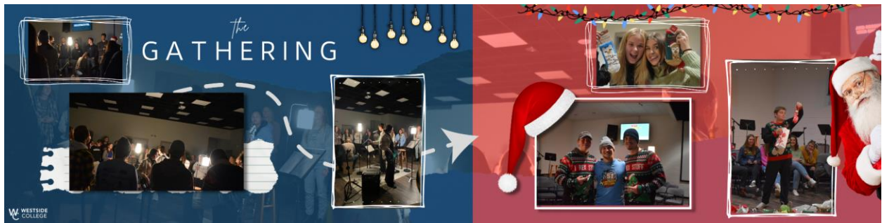
12.) The Gathering, Digital Instagram Post, 10X30, Fall 2022, TheGathering_Hoffman_G_Fall22