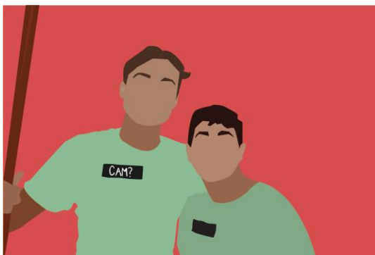
6.) Mop Crew, Digital Drawing, 14X22, Fall 2023, MopCrew_Hoffman_G_Fall23