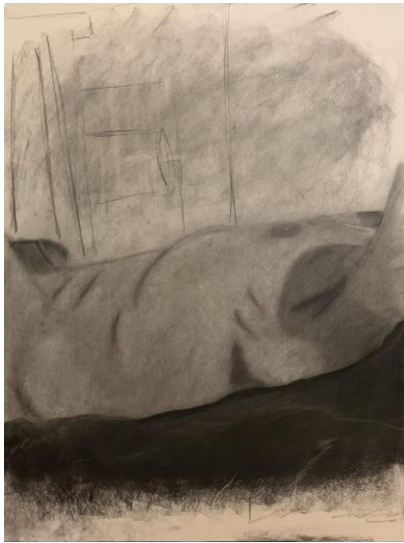
2.) Man Laying Down, Charcoal Drawing, 17X14, Spring 2022, Man_Laying_Down_Hoffman_G_Spring22