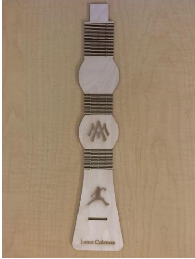
16.) Playstation Controller Mount, Laser Cut on Wood, 8x2x5, Fall 2020, ControlerMount_Hoffman_G_Fall20