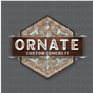
10.) Ornate Custom Concrete Logo, Digital Logo, 10X10, Spring 2023, OrnateCustom_Hoffman_G_Spring23