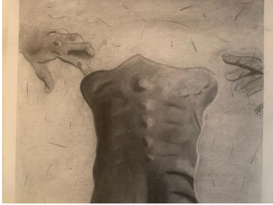
1.) REACH, Charcoal Drawing, 17X14, Spring 2022, Reach_Hoffman_G_Spring22