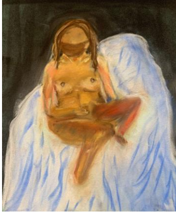
4.) Woman Sitting, Pastel Drawing, 14X12, Spring 2022, WomanSitting_Hoffman_G_Spring22