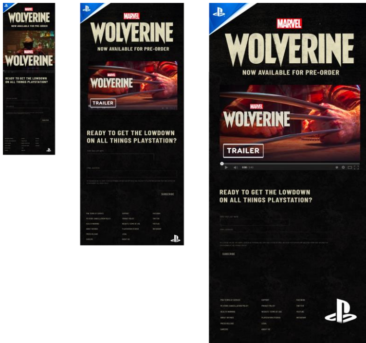
14.) Wolverine, Digital Responsive Design, 18X20, Fall 2022, Wolverine_Hoffman_G_Fall22