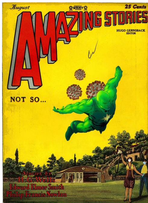
8.) Not So Amazing Stories, Digital Collage, 22X14, Fall 2020, Stories_Hoffman_G_Fall20