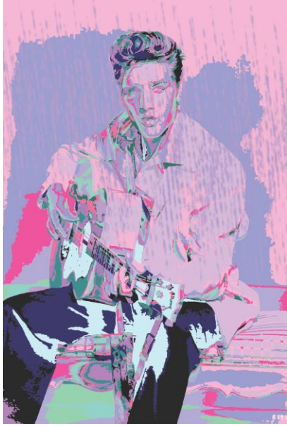
9.) Elvis, Digital Illustration, 22X14, Spring 2023, Elvis_Hoffman_G_Spring23