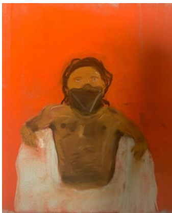
3.) Man Sitting, Pastel Drawing, 14X12, Spring 2022, ManSitting_Hoffman_G_Spring22