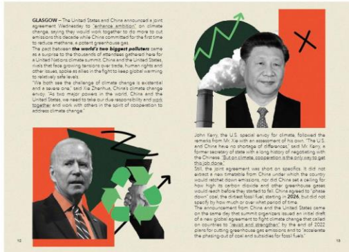
7.) Editorial Illustration, Digital, 14X22, Fall 2023, Editorial_Hoffman_G_Fall23