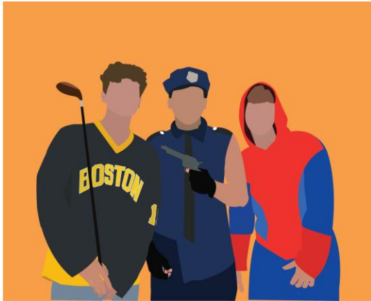
5.) Halloween Friends, Digital Drawing, 14X22, Fall 2023, HalloweenFriends_Hoffman_G_Fall23