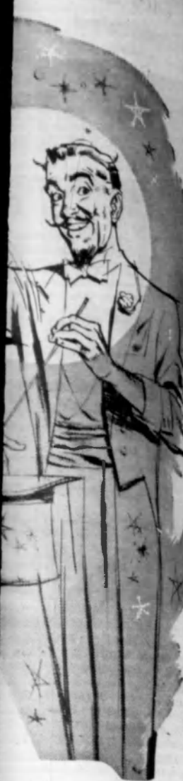
SOUTHERN BELL TELEPHONE AND TELEGRAM COMPANY