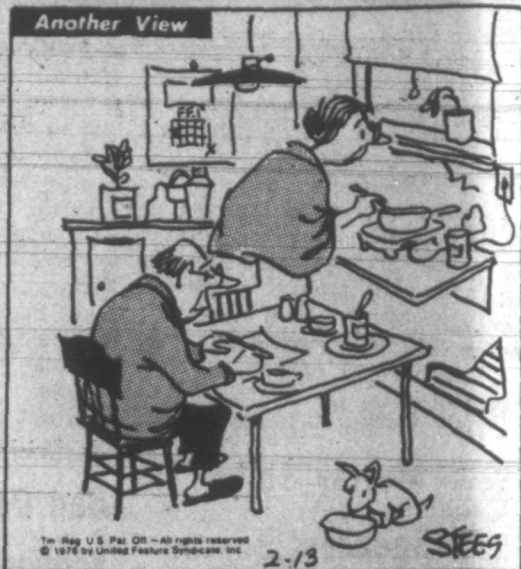
"DEAR MR. PRESIDENT, WE ARE GLAD TO KNOW THAT THE ECONOMY IS HEALTHIER AND THAT A TAX CUT IS POSSIBLE IN '79. WE WILL TRY TO HOLD OUT THAT LONG."

1974 VEGA STATION wagon, factory air, GT equipment. Extra sharp. $2,195. Call 753-2428 a.m. to 5 p.m., 753-5747 nights and weekends.