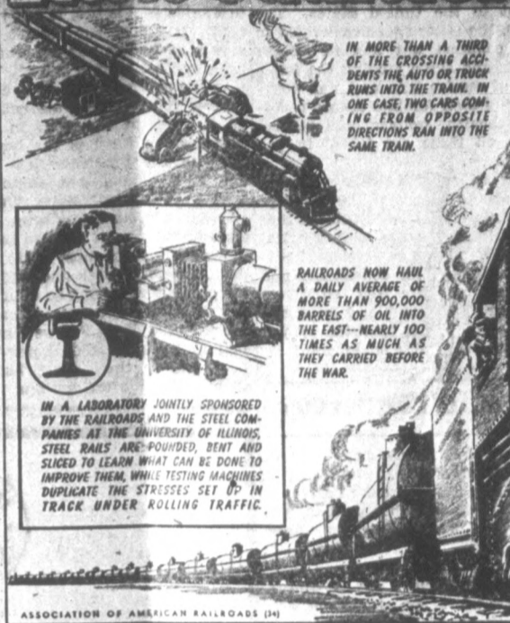
IN MORE THAN A THIRD OF THE CROSSING ACCIDENTS THE AUTO OR TRUCK RUMBS INTO THE TRAIN. IN ONE CASE, TWO CARS COMING FROM OPPOSITE DIRECTIONS RAN INTO THE SAME TRAIN.