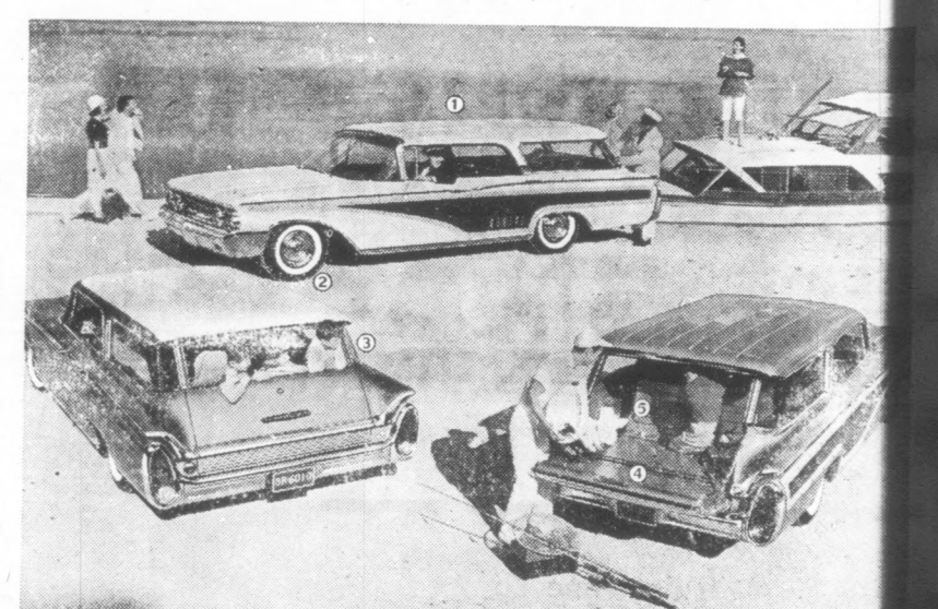
Beautiful new lower-priced 1960 Mercury Colony Park and Commuter Country Cruisers

—now only $50 more than wagons with "low-price names"