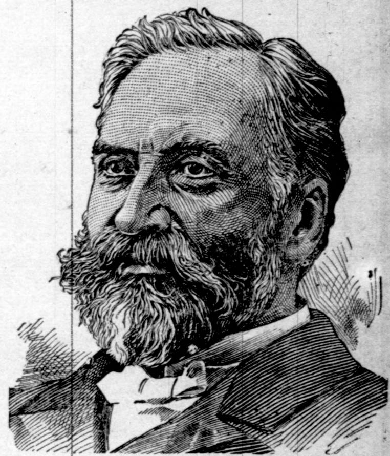
President McKinley is a church-going man.

The Eminent Washington Preacher Advises Paine's Celery Compound.