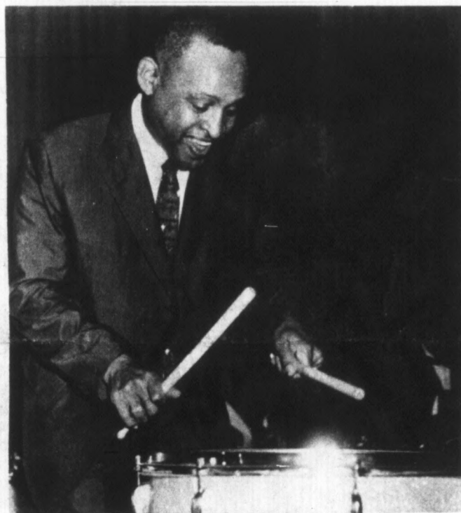
Lionel Hampton at the drums

National Partners of the Alliance last year. His home is in Denver, Colorado. He is a former chairman of the Color-