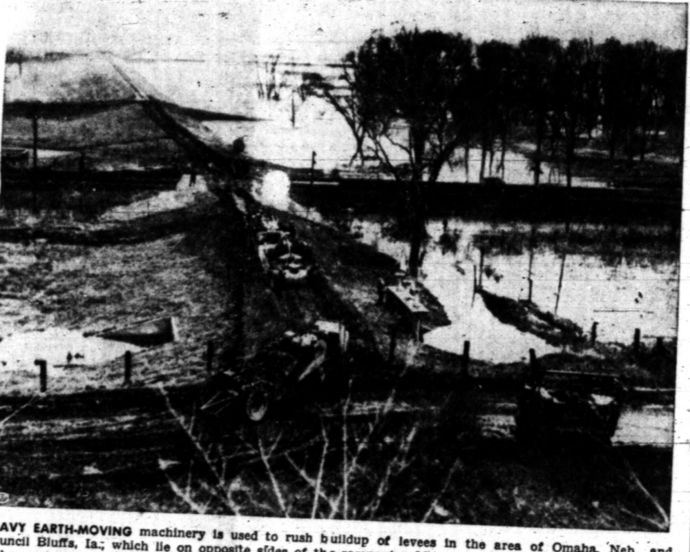
HEAVY EARTH-MOVING machinery is used to rush buildup of levees in the area of Omaha, Neb., and Council Bluffs, Ia., which lie on opposite sides of the rampaging Missouri river, as the flood torrent rises higher and higher. Water here is nearly up to Northwestern railroad.