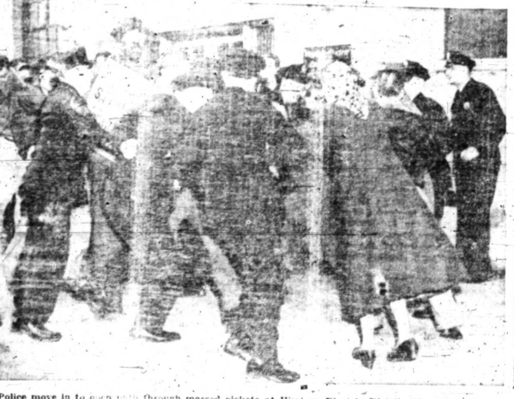
Police move in to open path through massed pickets at Western Electric Distributing company in Philadelphia. The policeman at far right was bitten during the skirmish in front of the building.