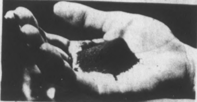
1. From tobacco seed to cigarette smoke more than three years pass in growing, cultivating, harvesting, curing, selling, aging, blending and manufacturing. This table-spoonful will plant three to four acres of famous Kentucky Burley.