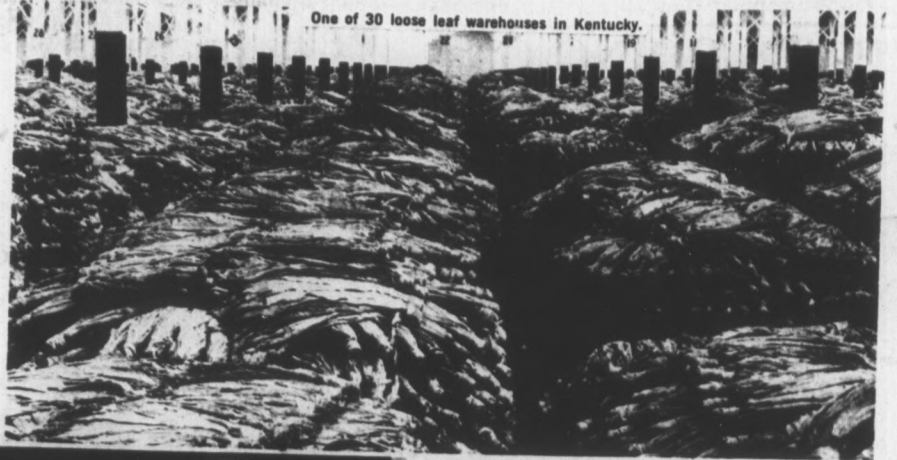
One of 30 loose leaf warehouses in Kentucky.