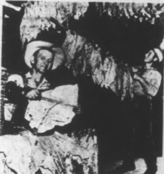
6. Ready for air-curing, harvested Burley goes on tiers of racks which extend to the roof of the barns. Ventilation is important; in very damp weather heat may be used if the curing is retarded.