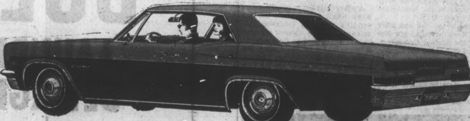
Chevrolet Impala Sport Sedan with Body by Fisher