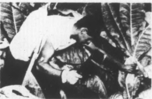
5. By late August, weather and insects permitting, tobacco is ripe for cutting. Each plant is chopped in the field; the harvest is speared on sticks for collection and transportation to the big, rectangular tobacco barns which are a familiar Kentucky roadside sight.