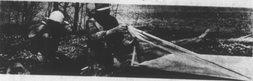
2. Kentucky Burley starts life balled in cheese-cloth covered seed beds. For the farmer, from old field burning to new crop to auction, tobacco raising is a year-round job. For the passerby, tobacco raising and selling is a year-round show, which starts in early spring with this familiar sight.