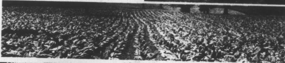
4. Two-months in the field, this crop will reach maturity during July; some fields as late as September. After flowering, the mature plants will be topped, leaving 16 to 20 leaves to ripen. Burley first appeared in the United States in 1864 as a hybrid on a farm in Ohio; Kentucky is the major producer of the 8-state Burley belt.