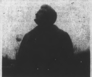
...wet and dry moon watcher

The appearance of the moon also plays a part in her predictions. "A 'wet' moon is a sure sign of rain comin' up, and, natur-