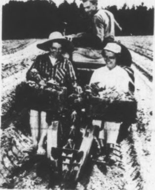
3. By late May-early June, the seedlings leave their beds by way of semi-automatic transplanters, or, on small farms, completely by hand. One acre of tobacco can require more than 488 man-hours of attention. But it's Kentucky's main cash crop, amounting to 40 percent of the state's total farm income.

A trip through one of Louisville's big four cigarette plants; Brown and Williamson, American Tobacco, P. Lorillard Company, or Phillip Morris, is a must for visitors. Another must is a stop at auction centers in Lexington, Louisville, Maysville, Carrollton, Owensboro, or one of several other Kentucky cities. At auction or plant, or just from a roadside view, what Ben Johnson called "that twaney weed tobacco" is a Kentucky product with universal demand.