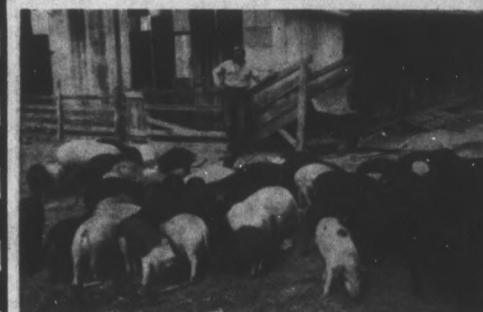
A. C. Weatherford and His Fine Herd

Is This A. C. Weatherford Herd of 106 Weaned at 4 weeks. At 8 weeks and 4 days they averaged 55 lbs. on 67.7 lbs. feed per head at a cost of $2.93 for pig feed.