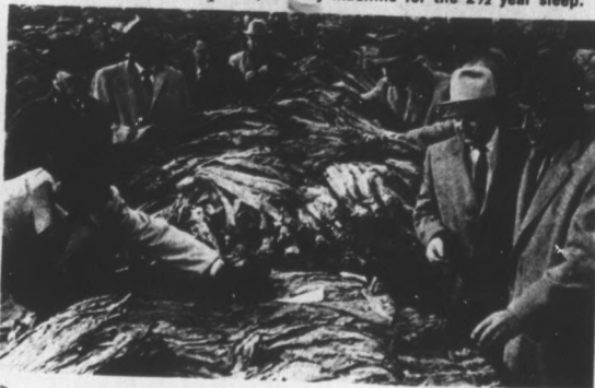
8. This is it: auction time from November to February. Now the farmer will know how his year-long work paid off. To the tune of the familiar auctioneer's chant, buyers quickly select their choice; each basket is disposed of in about 10 seconds. Visitors are welcome to the colorful auction warehouses in Kentucky. One whopper in Lexington covers more than seven acres.