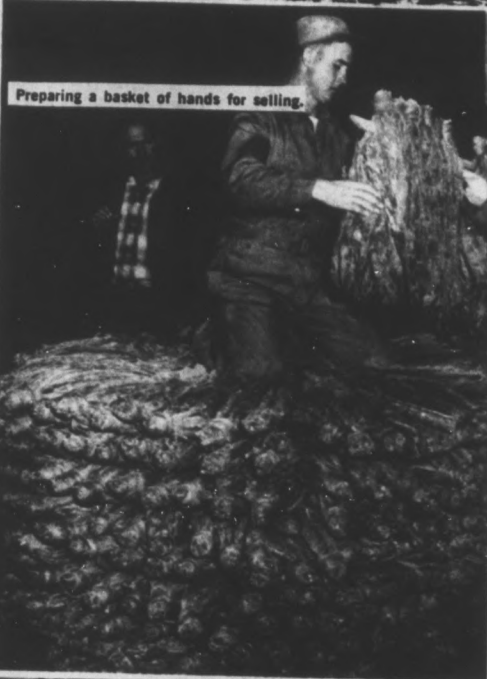
Preparing a basket of hands for selling.