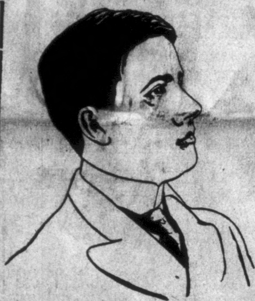
GOV. J. C. W. BECKHAM

The resolutions condemn the "unnecessary and unjust system of Federal taxation maintained by the Republican administration," and demand a revision of the tariff in a conservative spirit. The increase of expenditures of the Federal government under Republican rule is condemned and the encroachments by the president upon the constitution are denounced. The resolutions