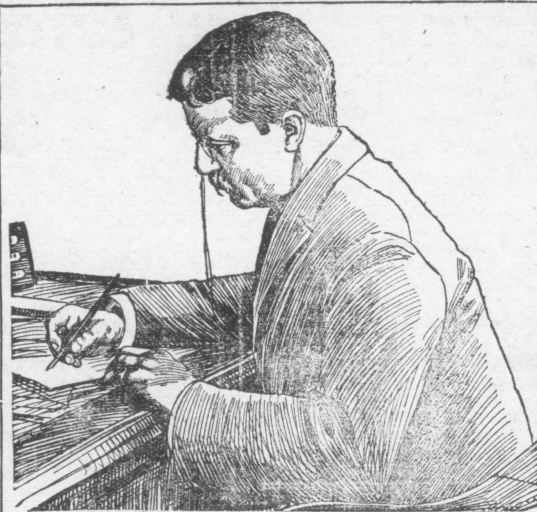
PRESIDENT ROOSEVELT AT HIS DESK.

WASHINGTON, D. C., Dec. 14.—President Roosevelt sent a special message to the senate, today, saying that although there was no doubt about the guilt of some of the discharged negro soldiers in the Brownsville matter he is willing for those not actually guilty to be reinstated if they will tell all they know and not shield guilty companies.