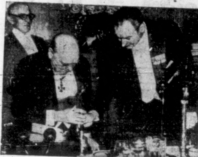
SIR WINSTON CHURCHILL receives the first Williamsburg award in a ceremony in London, from Winthrop Rockefeller (right), chairman of the trustees of the restored shrine in Virginia. Churchill was chosen unanimously by the trustees to receive the silver town crier's bell and $10,000 for his "unexampled contribution in our time, to the historic struggle of men to live free and self-respecting in a just society."