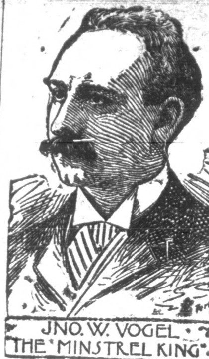
JNO. W. VOGEL "THE MINSTREL KING"