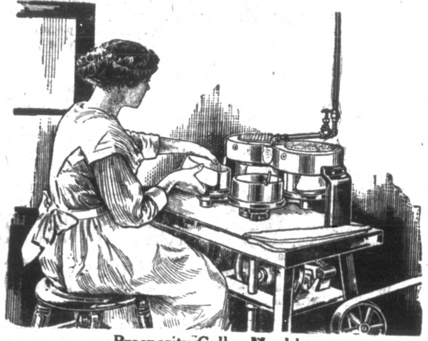
Prosperity Collar Moulder

Guaranteed Results No breaking of edges An Ideal Domestic finish. No Friction Tear Ample Tie Space. Shapes the damp collar by Steam Pressure and eliminates breakage and wear.