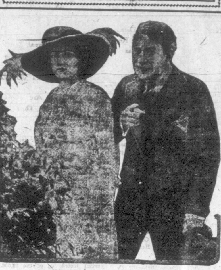
"You See? He Does Not Love You!"

By GRACE DARMOND. My home is in Chicago. One day about two years ago I walked into the Chicago studios of the Selig Polyscope company.