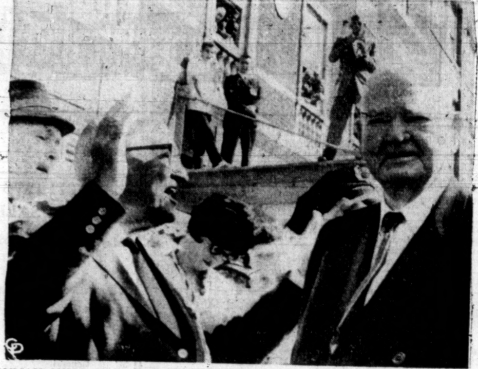
TRUMAN SINGS OUT PRAISES FOR HOOVER — "Sing it out" shouts former President Harry Truman as he leads group striking up "Happy Birthday" for 88-year-old former President Herbert Hoover in Cedar Rapids, Iowa. Truman, who praised the former President as "one of the greatest men in the world," later joined Mr. Hoover for the dedication of the Herbert Hoover Presidential Library in West Branch, Iowa.

KARLSKROGA, Sweden — Master Gregory of Kansas City, Kan., drove his British Lotus over the 35.923 miles in 42 minutes, 51.32 seconds Sunday to win the Swedish Grand Prix auto race for formula one cars.