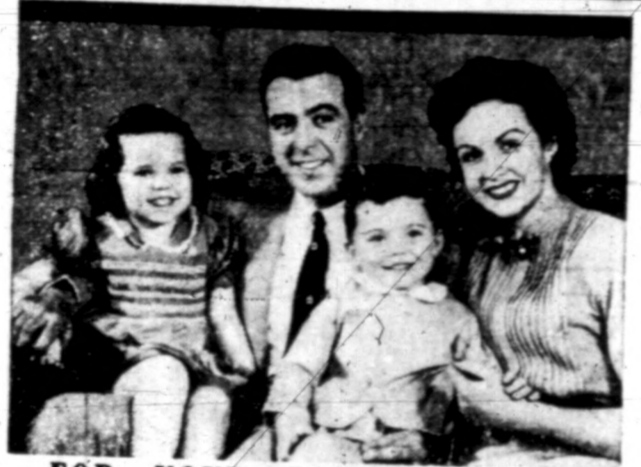
FOR YOUR FAMILY'S SAKE CHOOSE