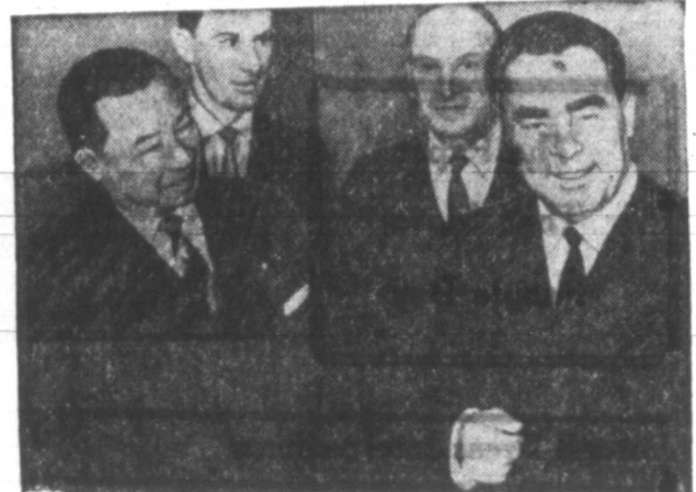
CANCELS WASHINGTON VISIT—Souvanna Phouma (left), ousted neutralist Laos premier, is shown in Moscow with Leonid Brezhnev, chairman of the Presidium of the Supreme Soviet, when Phouma decided to cancel his imminent Washington visit because Secretary of State Dean Rusk would be out of town on the day of his arrival and he had no assurance he would see President Kennedy. Phouma is touring western and Communist capitals.