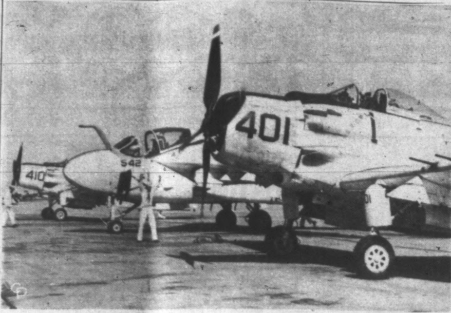
END OF THE LINE The last prop-driven fighter in the U.S. Navy's air arm, the A1H Skyraider, is retired in ceremonies at the Naval Air Station in Jacksonville, Fla. The Skyraider (foreground) is being replaced by the A6 jet fighter (center).

Your continued interest in ir IRS generally has three years from the filing deadline of the in other ways than concern for return to examine the return