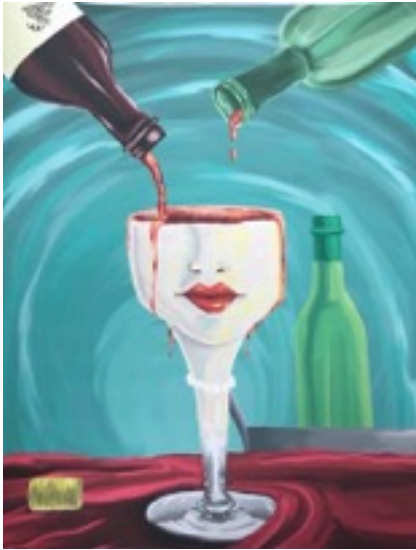
“Beautiful Mind”, Digital Illustration, 2018, 9 1/2 x 12