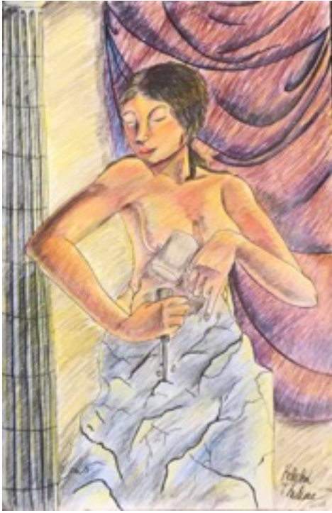
“Idealism”, color pencil, 2018, 12 x18