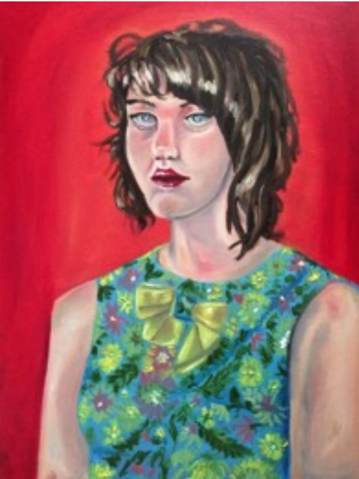
“April”, Oil on Canvas, 2017, 24 x 18