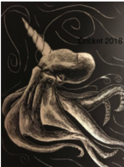
“Octocorn”, Scratchboard, 2018, 8 1/2 x 11”