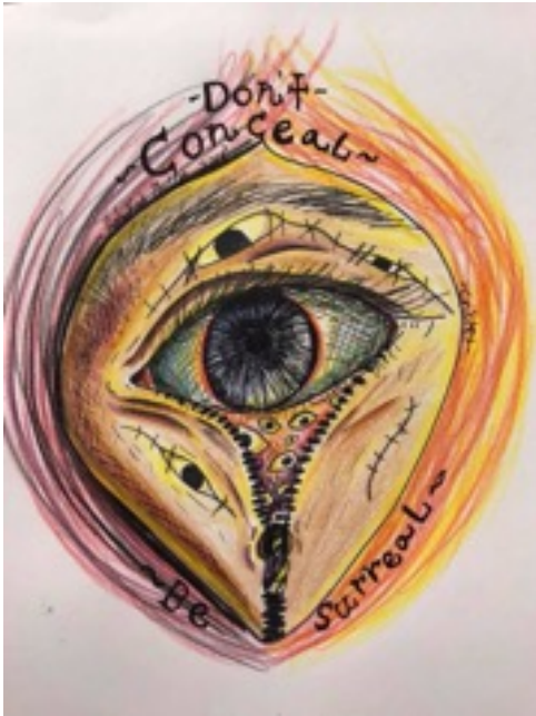
“Don’t Conceal, Be Surreal”, Pen and Colored pencil, 2018, 7 x 6 3/4 in.