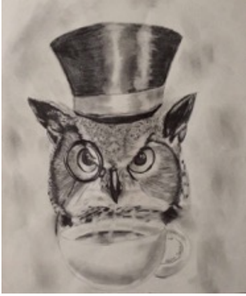
“Dapper Owl”, Graphite, 2017, 8 x 10 in.