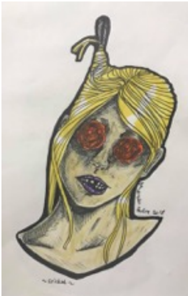
“Spaghetti Sister #2”. Pen and Ink, 2018, 8 3/4 x 5 3/8 in.