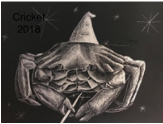
"Magic Crab", Scratchboard, 2018, 8 1/2 x 11