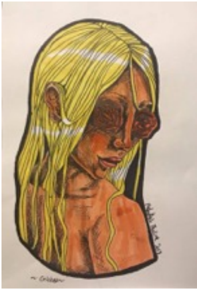
“Spaghetti Sister #1”, Pen and Ink, 2018, 8 3/4 x 5 3/8 in.