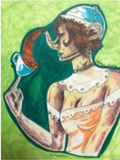
“Tea Time” Pen and ink, 2018, 8 1/2 x 7 in.