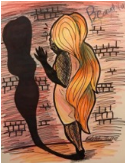
“See Yourself as Beautiful”, Pen and Colored Pencil, 2018, 7 1/2 x 6 in.