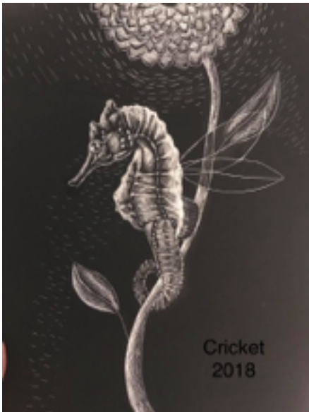
“Sea Fairy”, Scratchboard, 2018, 8 1/2 x 11