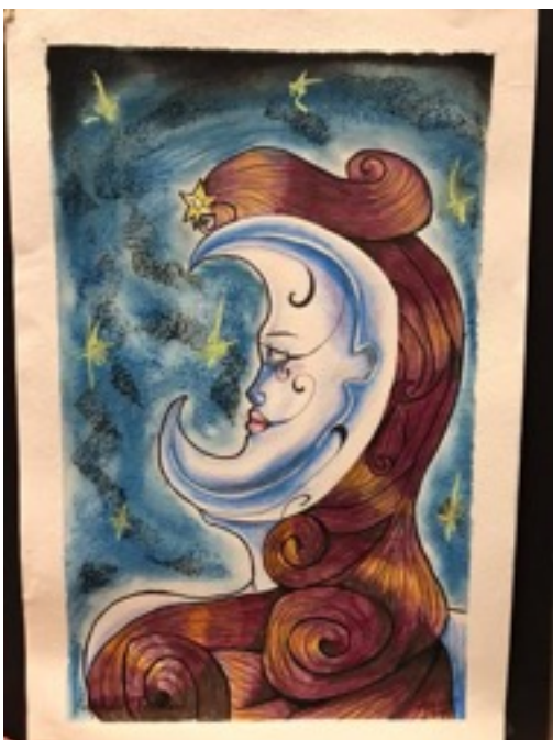
“Lady of the Moon”, Mix Media, 2018, 12 x 18 in.