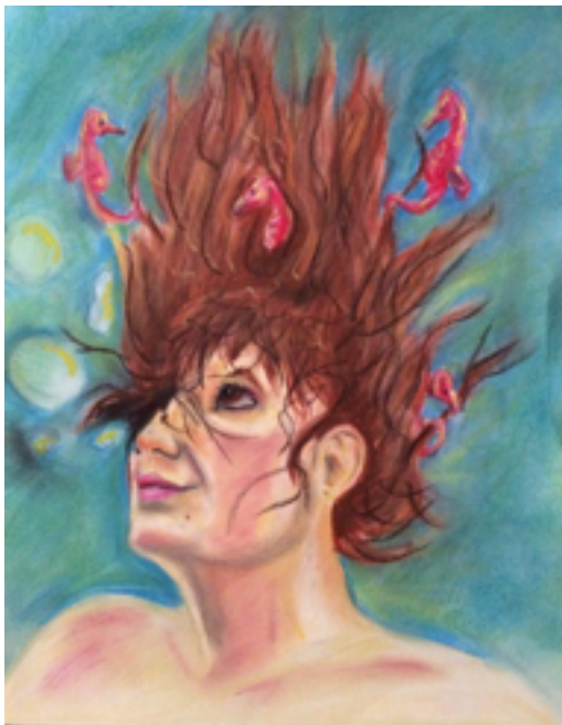
"Sea Self (self portrait), Pastels, 2017