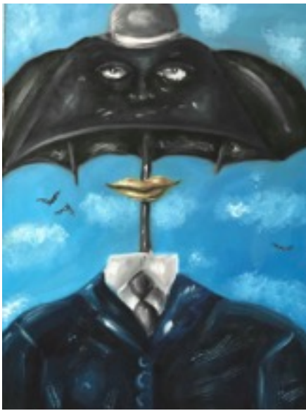
“Manbrella”, Oil on Canvas, 2017, 24 x 18 in.