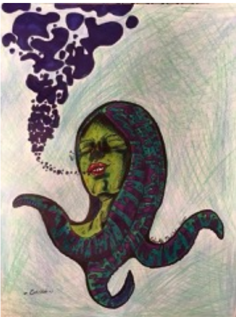
“Bubbly”, Pen and Ink, 2018, 11 x 8 1/2 in.