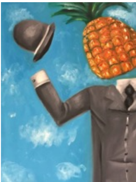
“Mr. Ananas”, Oil on Canvas, 2017, 24 x 18 in.